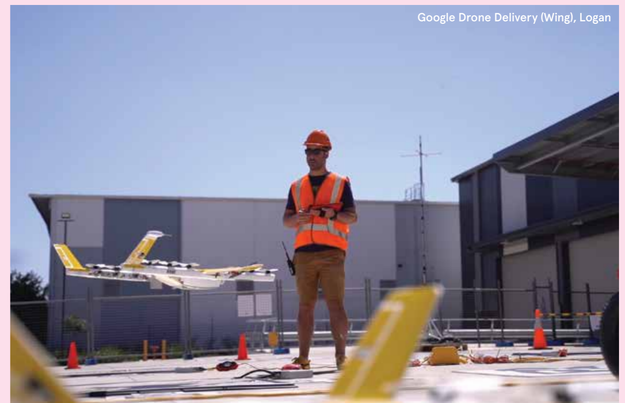
Google Drone Delivery (Wing), Logan