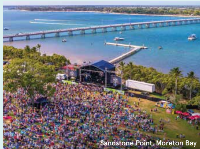
Sandstone Point, Moreton Bay

One of the world's oldest First Nations heritage in the world. A booming, progressive city region without the bustle and with more time to enjoy it.