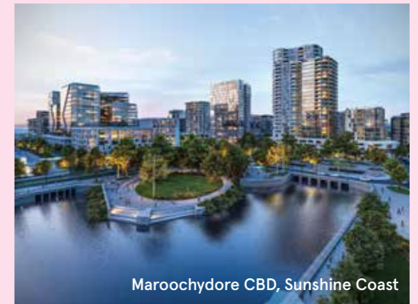
Maroochydore CBD, Sunshine Coast

Students from 100+ countries studying in Brisbane