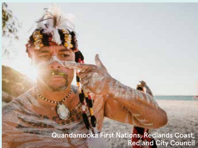
Quandamooka First Nations, Redlands Coast, Redland City Council