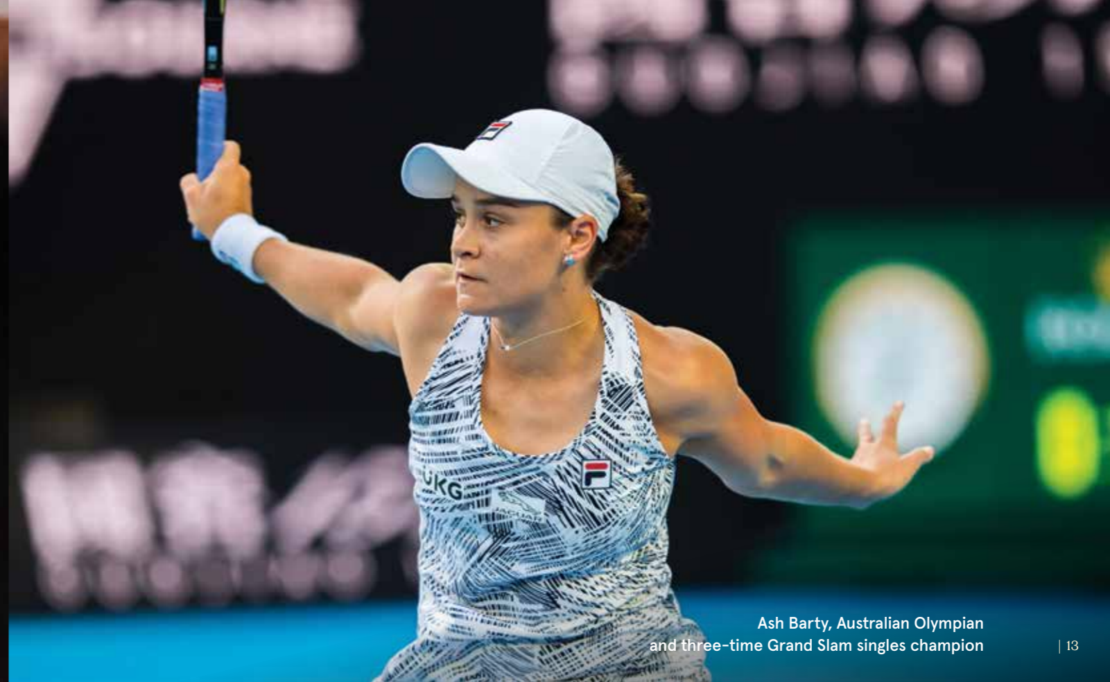
Ash Barty, Australian Olympian and three-time Grand Slam singles champion