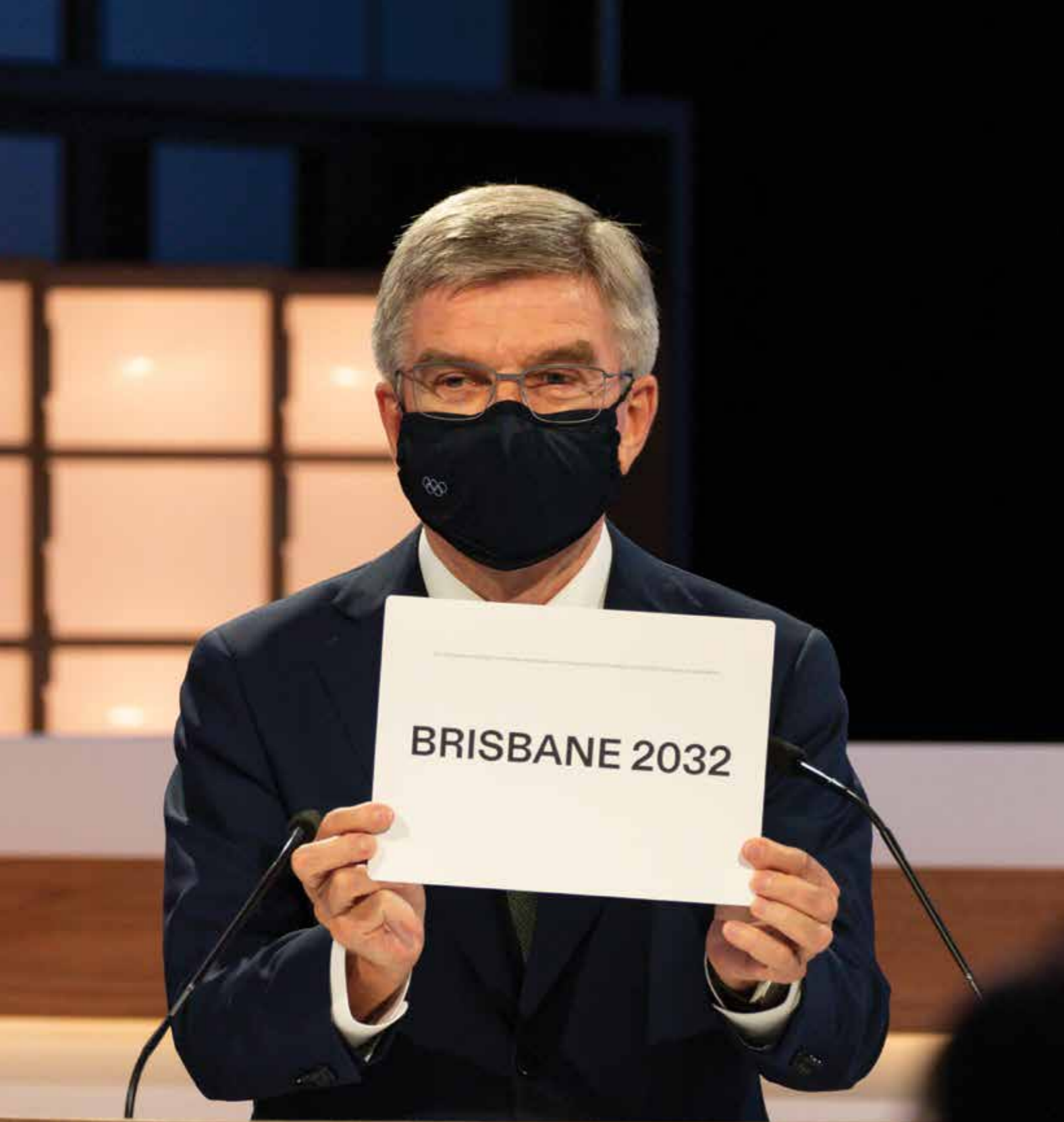
IOC President Thomas Bach announces Brisbane as the host city for the XXXV Olympiad